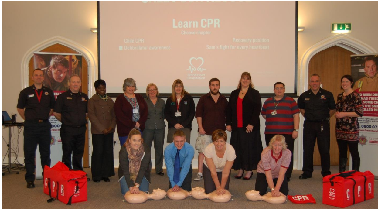
CPR Training at Council Headquarters

We will seek to ensure operational response and preparedness within Argyll & Bute is maintained by: