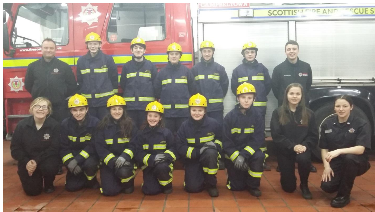
Young FireFighters unit based at Campbeltown Community Fire Station.

Overseeing the performance of the SFRS at local level is the responsibility of Argyll & Bute's Policy, Review & Scrutiny Committee. Within this forum the Committee undertakes the process of scrutiny to monitor progress against the priorities within Argyll & Bute's Local Fire and Rescue Plan and also engages with the Local Senior Officer in matters arising on a regional or national basis.